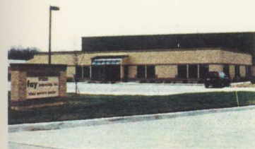
Fay Industries has been family owned and operated since 1974.

Fay Industries carries virtually any shape and size of steel—including tubing, angles, channels, and flat bars—and turns them into something useful for a variety of other businesses, ranging from the automotive to the toy industries. Imagine that.