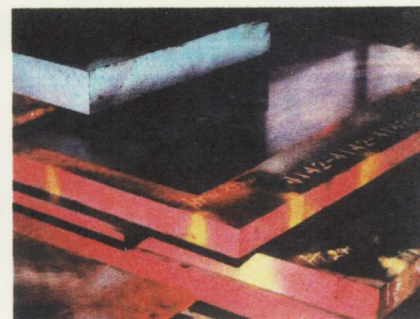
Now housed in their new 46,000 square foot location on Foltz Parkway in Strongsville, Fay Industries continues to be a leader in the steel supply service business.

Fay takes basic steel bars and turns them into something useful for a variety of other businesses, from the automotive to the toy industries.